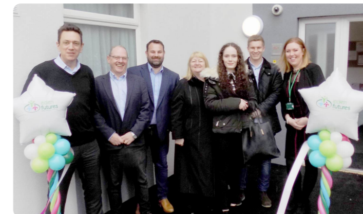
Staff from Eden and BeST